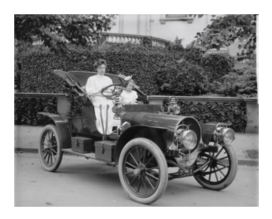
Figure 1: 1907 Franklin Model D roadster.