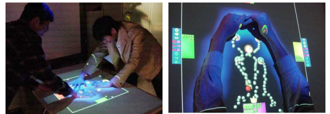
Figure 4: "Marble Market", a video game for a table-size SmartSkin. In right figure, a player corrects marbles by using their both arms.

tem, which allows the user to manipulate 4 control points of a bezier curve simultaneously.