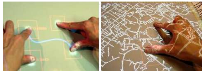
Figure 3: Examples of uses of a multiple pointing input: left: curve editing. right: a map browsing system. The user can use one finger for panning, or two fingers for simultaneous panning and rotating.

This system allows the user to move multiple objects on a screen concurrently. Figure 3 shows a curve editing sys-