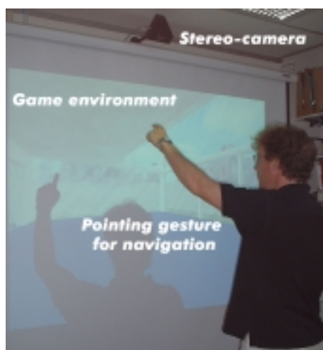
Figure 2: A user interact with a virtual world using the gesture interaction model.

- Location driven interaction. Motion semantics are given by a position-defined state, which are made apparent by physical objects (icons) in the real world. For example moving to different positions on the floor trigger different events and movements in virtual world.