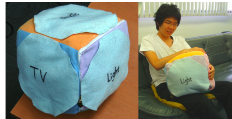
Figure 1: Visual appearance of C^3 . C^3 can be used both as a cushion and as a controller. The physical body is visually appealing and suitable for living spaces like everyday objects.

There are many researches about interaction techniques for the remote control of information appliances. Most of them present input methods alternating many small buttons[1, 2, 3, 4]. These systems use vision-based technique or sensors (e.g.