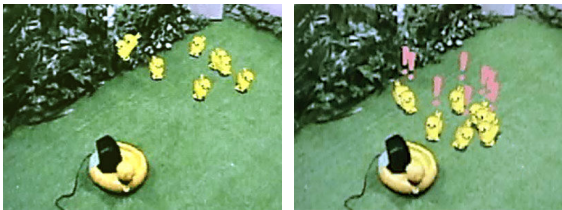
Figure 4: Computer-generated ducklings gather (move) toward the position of real mother duck where squawking sound is played.