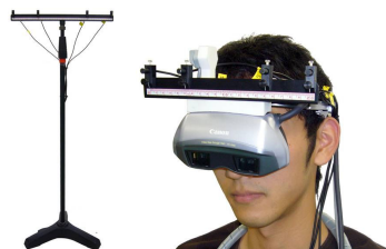
Figure 2: Microphone arrays (Left: fixed type, Right: wearable type)