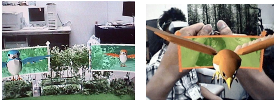
Figure 3: Users can select a menu item using a sound direction. In this figure, a birdcall is used as a sound device.